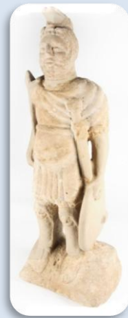
Statue of Mars

Gorgons were mythical creatures with snakes instead of hair, snake skin and fangs. They had claws instead of hands and in carvings they usually have their tongues sticking out. It was believed that the gorgons could freeze men in their tracks by looking them straight in the eye. The gorgon faces were designed to scare the enemies and are similar to the masks which children wear at Halloween. Because the Romans thought that gorgon faces were so terrifying, they also believed that they would ward off evil spirits and would help them scare away enemies in battle.