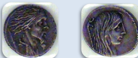
Coins with male and female Celts

We call the people who lived in Caledonia during the Roman invasion the Celts. The Celts lived in small tribes ruled over by chieftains. We know that the Celts were farmers and fierce warriors. However, most of the information about the Celts we have today was written from a Roman perspective so we don't know how accurate it is.