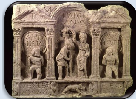
Hutcheson Hill distance slab

As there was not much space on the distance slabs, stone masons wrote in an abbreviated form of Latin. For example, in some of the inscriptions the letter P was written before the numerals. This stands for passum or paces and tells us how long the completed section of the Wall was.