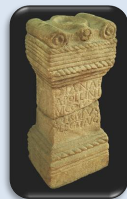
Altar to Diana and Apollo

Diana and Apollo were twin gods who were associated with hunting. We can assume that Firmus enjoyed hunting and was asking the gods for good luck in the chase.