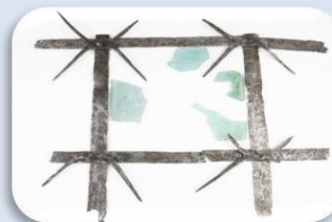
Window grille and glass

The tile tells us that the Romans kept dogs in the forts, probably to help them when hunting animals. We can imagine a dog running round the fort looking for scraps of food – he was no doubt told off for walking over the freshly-made tiles before they had fully dried!