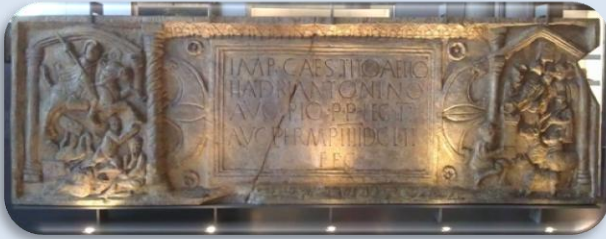
Bridgeness distance slab

The distance slab on display is a cast of the original, which is currently housed in the National Museum of Scotland in Edinburgh.